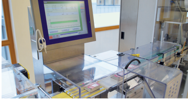
The clearly structured user interface enjoys fast acceptance among operators; product switchovers take no time at all